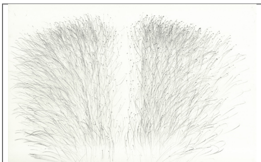
Scratch Drawing graphite on paper 11" h x 17" w 2011

On view at Nine Gallery, December 1 – 31, 2011